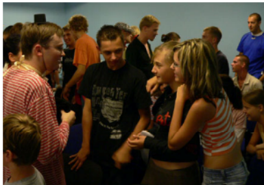
Interaction with the youth after performing THE CHAIR.