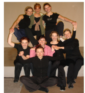
A good-bye pose till spring,