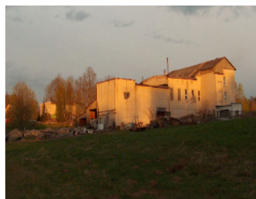
Church house and school in Latvia

NEW MINISTRY -The church house where the school is housed also houses 26 substance abuse men and women (plus one baby) in a fabulous drug rehabilitation program. We love these people very much and have begun an interactive program with them using the arts. Inspired by our productions, they put together their own show about their life as drug addicts before they were redeemed by Christ. You would never forget them, if you met them. They truly know the meaning of being 'born again'.