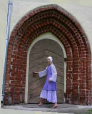
KATRINA at the door

Finally, the Purple Line Theatre presented Katrina: Patron Saint of Kuldigas to a captivated audience in front of the Katrina Church (named for its saint) introducing a new theatrical genre-a movement opera. Using the Fourth symphony of Imants Kalnins the actors moved with large sticks and rope continuously, like the lyrics of an opera, to portray the moving fate of Katrina- a young martyred saint of the middle ages. The Purple Line Theatre was awarded the invitation to open the Kuldigas Festival in June of 2008 with a performance of Katrina: Patron Saint of Kuldigas . This was a handsome reward for the near sleepless nights of training the cast lived through during rehearsals and will insure many more will experience the power of this young girl's love for God.