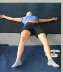
I can't rehearse another hour!