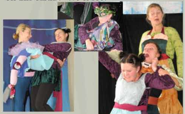
Midsummer Night's Dream

The Purple Line Theatre 2007 was a banner year for this wonderful theatre with three award winning productions. The Lost Princess continues to receive awards at festivals and win invitations into the schools (precisely our planned goal). This beautiful production mentors a Christ-like character in children and gives direction to their lives. Midsummer Night's Dream for Young People premiered this summer in a theatre festival for all-women companies and immediately set off on tour. This most creative and unique physical theatre production of Shakespeare's famous comedy begs the question to teenagers; what is this love thing all about?