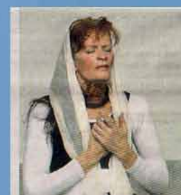
Kad spītīgi izlēts šķipsniņš, tad sirds, kas agrāk atteikās lūgt Dievu, pati nostājas pieļūsmas pozā.